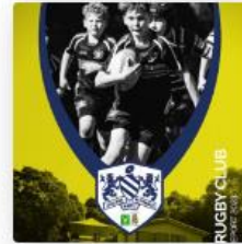
2023 Annual Report