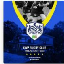
2022 Annual Report