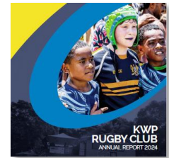
2024 Annual Report