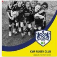
2020 Annual Report